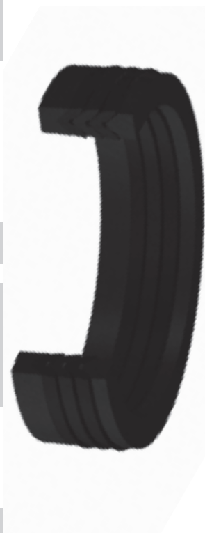
vee pack sets