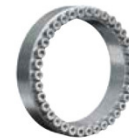
RfN 7012 stainless steel