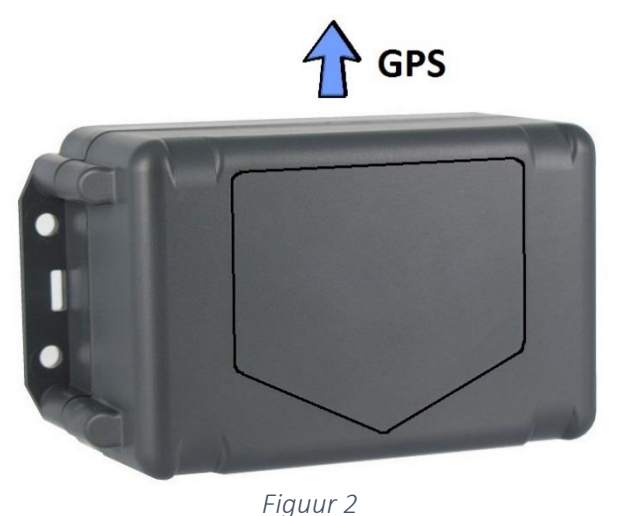
The GeoLocker please can by assembled with the supplied tie wraps or screws. Also note that you can't place the Geolocker in an enclosed metal space, this may affect the GPS and GSM signal reception negatively. The dimensions of the GeoLocker be found on the back of this manual. Make sure the GeoLocker is secured firmly using the supplied screws or tie wraps to benefit the optimal function of the motion sensor.

Check that the cover seal is positioned neatly in the recess and that it is not damaged before proceeding to screw the cover in place. Secure the cover using a Philips 1 cross-head screwdriver. The arrow-shaped logo on the housing compartment should face with the point downwards, for the best possible GPS signal.