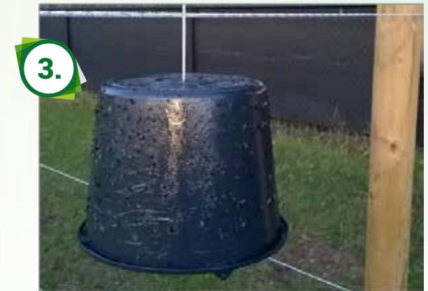
The horsefly bucket trap applied with Sticky Trap