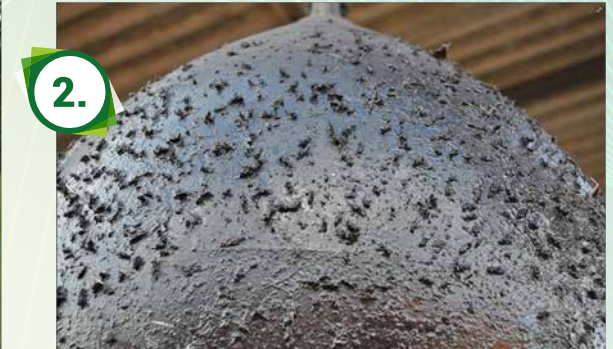
A black suspended horsefly-ball with Sticky Trap glue

We point this out because there is a number of companies that promote mice glue that is poisonous and prohibited in Europe. If a bird, horse or other animal gets stuck in this type of glue it can cause real problems, which can be avoided!