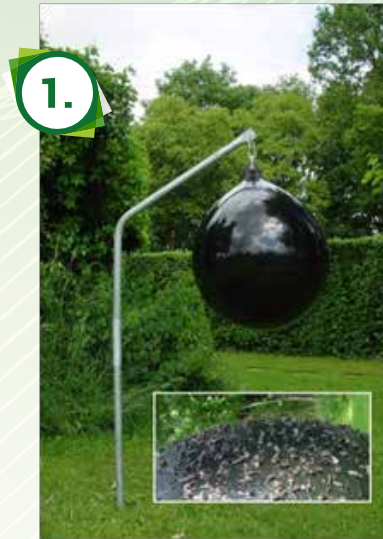
The Loer glue trap