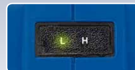
Display Volume (L) and Pressure (H) and battery charge indicator