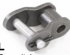
L One pitch Offset link