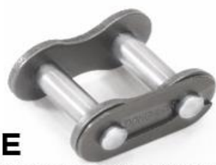
E Spring connecting link Loose fit