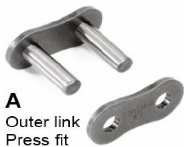
A Outer link Press fit