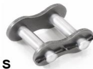
S Cotter connecting link Loose fit