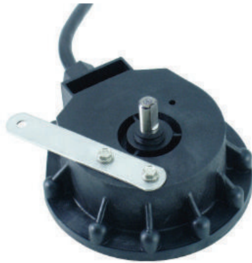
Application Rate Sensor