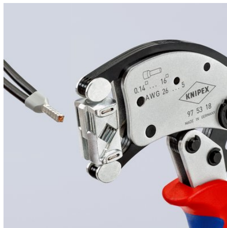
Twin wire ferrules up to 2 x 6 mm 2 can be crimped without adjustment