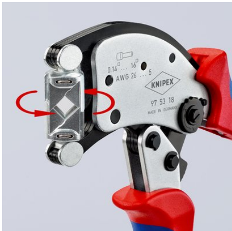
Crimp head can be rotated 360° for optimal accessibility, even in confined spaces