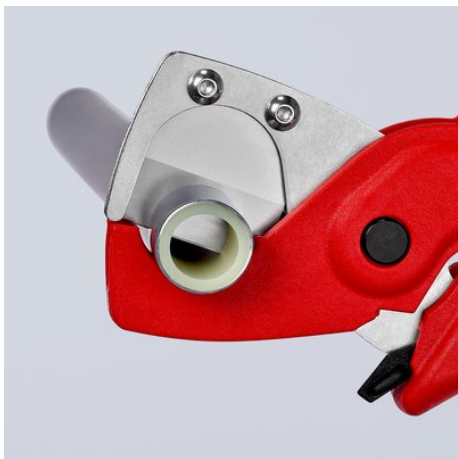
The high-strength, sharp blade cuts composite and plastic pipes smoothly and free of burr