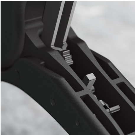
The positive lock always ensures the perfect contact pressure