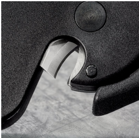
With cable cutter for conductors up to 10 mm 2