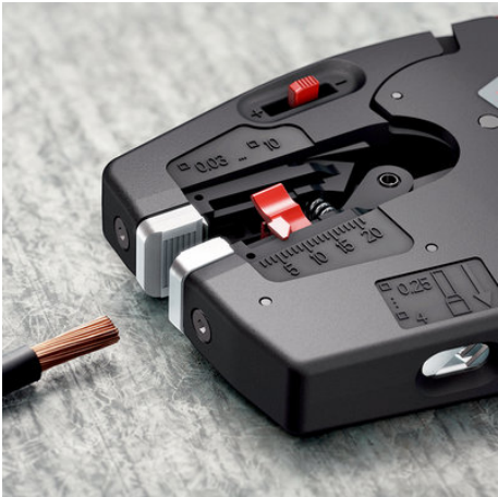
Automatic stripping up to 10 mm².