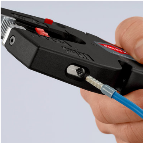
Square crimping point for wire end ferrules 0.25 - 4 mm²