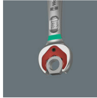
Ring ratchet spanner Joker 6000

The Joker's holding function means that nuts and bolts can be held in the jaw and easily positioned where they are needed. Fastening on to the thread can then be done quickly and safely, thanks to the innovative special stop-plate which holds the fastener. No more time-wasting searches for dropped nuts and bolts! After applying and positioning the nut or bolt, fastening can begin immediately - no additional tools required.