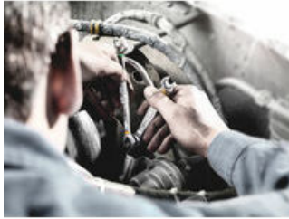
Joker open-ended wrench

The ratcheting feature at the ring end boasts an exceptional, fine tooth mechanism - 80 teeth in all - which provides greater flexibility, even in very confined working spaces.